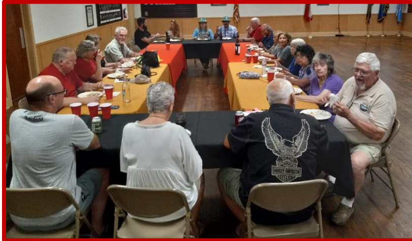
Figure 6 Enjoying the "Spargel" Dinner.

Our ALR cook team prepared burgers for the post car and bike show. Our Spargel (asparagus) Social was a complete hit. Plan to attend our Zwiebel (onion) Social, which will be in October, so start looking up some recipes.